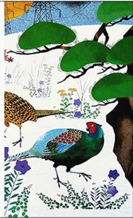
21 st Century