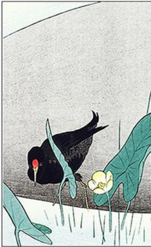
19 th Century