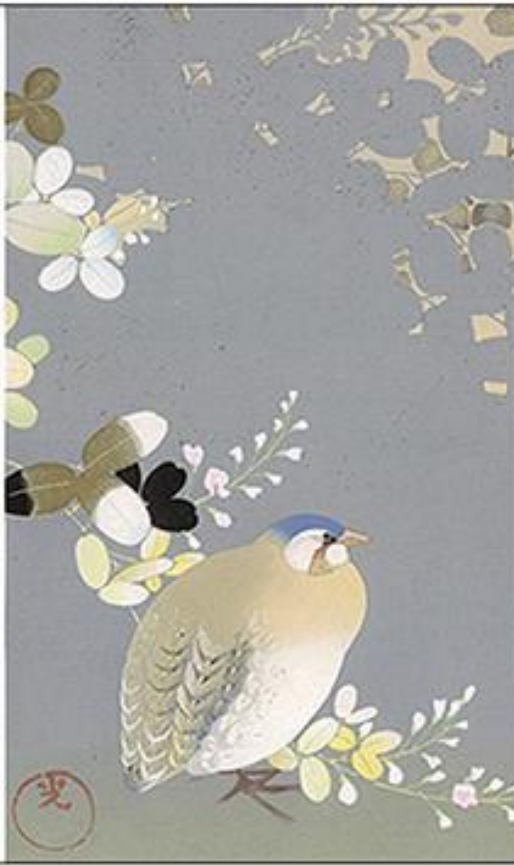
20 th Century