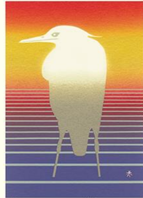
6 Egret ( Egretta sp.) by Hidenobu Oshima, 210 x 275 mm