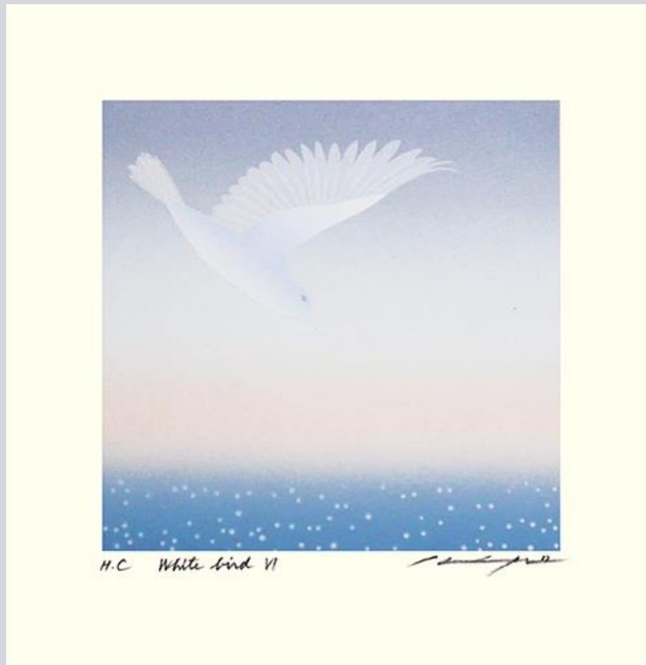
17 Unknown bird by Shigeyuki Ōhashi, entitled white bird VI, 1987, 260 x 270 mm