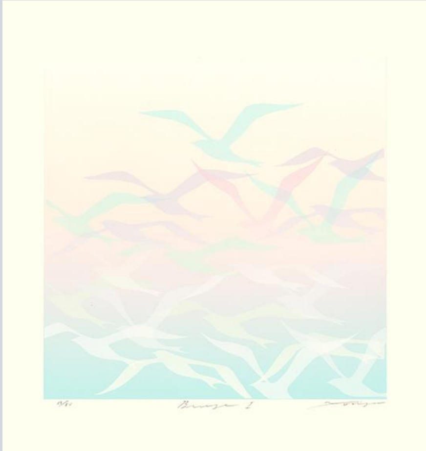
1 Gull ( Larus sp.) by Shin'ichi Yoshizu, entitled Breeze I, 275 x 290 mm