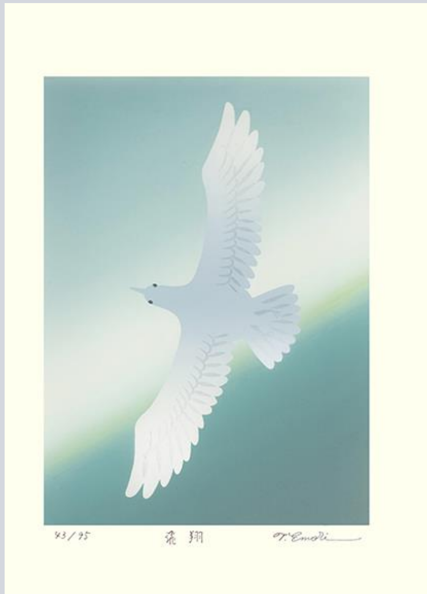
15 Gull ( Larus sp.) by Teruo Emori, entitled flying, 195 x 275 mm