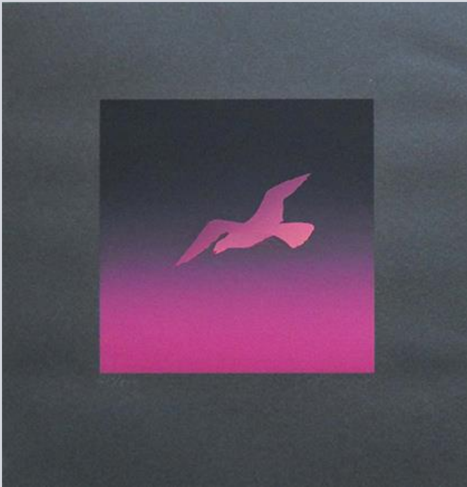
7 Dove ( Columba sp.) by Hiroshi Kubota, 260 x 270 mm