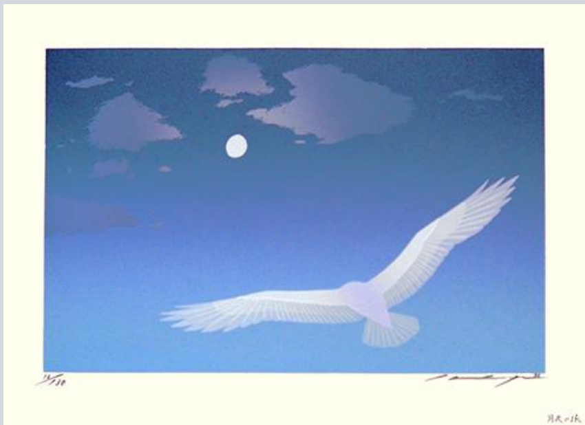
20 Gull ( Larus sp.) by Shigeyuki Ōhashi, 1990, 375 x 275 mm