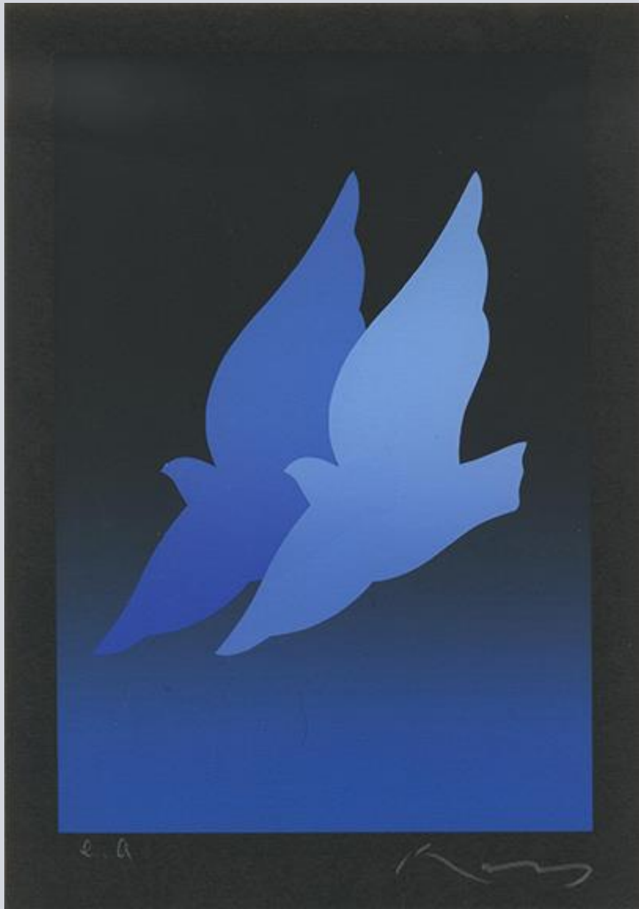
11 Dove ( Columba sp.) by Kōzō Inoue, 120 x 170 mm